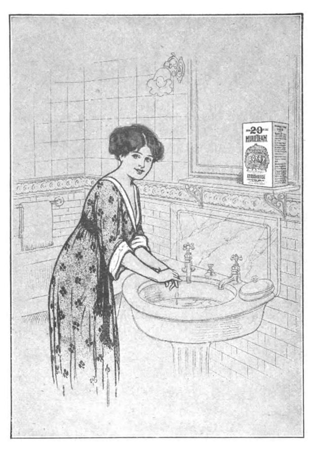
BORAX MAKES BATHING A PLEASURE