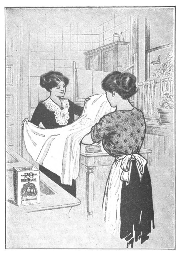
BORAX SAVES AND WHITENS THE CLOTHES