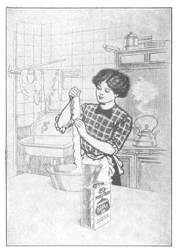
BORAX CLEANS FINE LACES WITHOUT INJURY