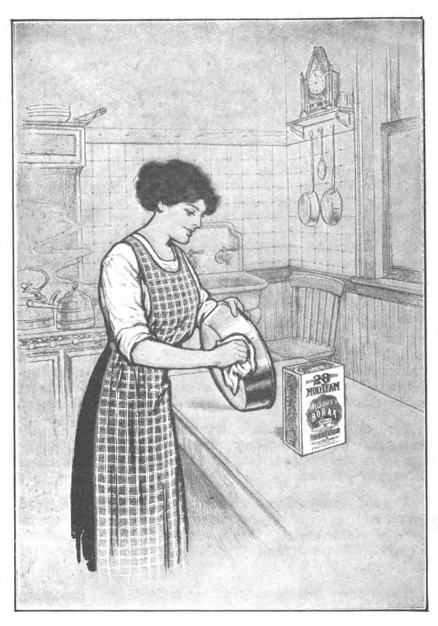
BORAX CLEANS THINGS CLEAN